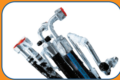
MOBILE REFRIGERATION & A/C