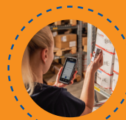
Material Handling & Logistics