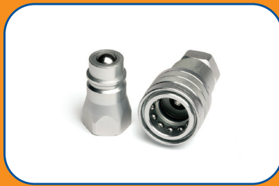
QUICK RELEASE COUPLINGS