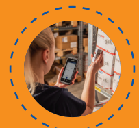
Material Handling & Logistics