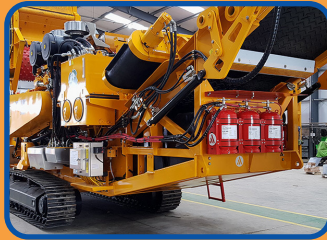
Vehicle Fire Suppression Systems