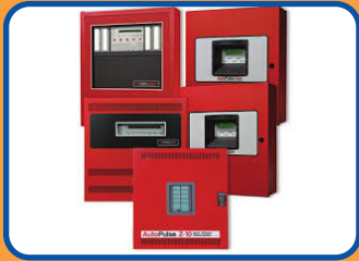
Electrical Cabinet Protection