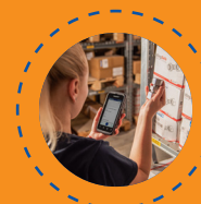
Material Handling & Logistics