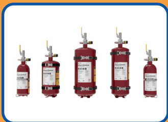
Direct Clean Agent Fire Suppression Systems