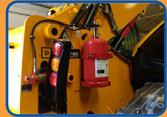
Fixed Foam Fire Suppression Systems