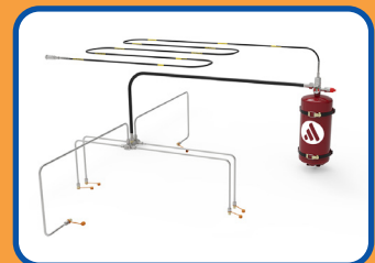
Indirect Chemical Systems