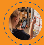
Material Handling & Logistics